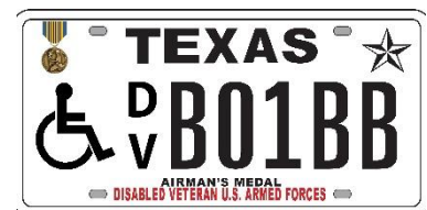
Plate with Stacked DV Alpha Characters

To assist in the manufacturing process for the newly designed Disabled Veteran (DV) ISA plates, an exclamation point ("!") is used in the manufactured plate number as a placeholder for the Stacked DV text characters. As a result, you will see ! in the Mfg Plate No field and DV in the Plate No field on the Special Plate Information SPL002 screen.